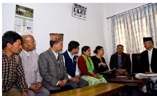
Meeting between Chairperson of Constituent Assembly and Representatives of the organizers.