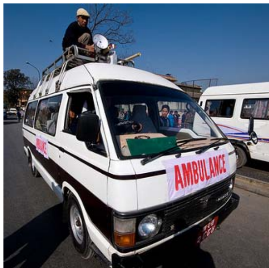
Ambulance going to the office of different government bodies.

The ambulance action was started from the Open air Theatre in Kathmandu. The aim to invigorate public action through the launch event – themed around 'dying justice' – the body of justice was taken by 'ambulance' to the Army Headquarters and Office of the Chairperson of the Constituent Assembly. The ambulance carried a delegation of survivors and family members who lost loved ones. The delegation presented at each destination a 'prescription' prescribing what each authority must do to save justice in Nepal.