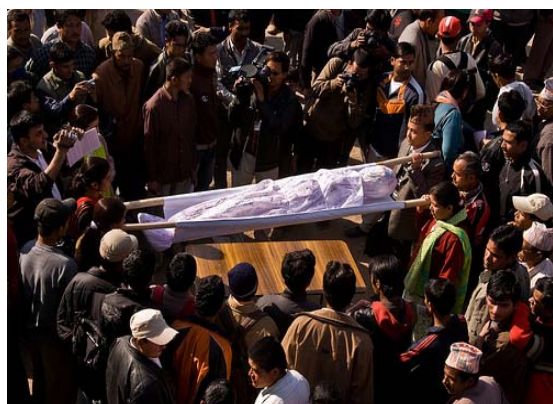
Body indicating the dying justice being taken to the programme venue.

Amnesty International Nepal along with other civil society and human rights organizations including Accountability Watch Committee (AWC), Advocacy Forum (AF) and Collective Campaign for Peace (COCAP) and in collaboration with families of the 'disappeared' and survivors of human rights abuses, and with the support of OHCHR-Nepal and other human rights organizations, organized an event named "Ambulance Action" under the slogan 'Prosecutions Now! Save Justice' on 17 February in Kathmandu.