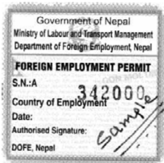
Figure 10: Labour sticker placed in passports verifying approval by the Ministry of Labour

Going through such irregular channels means that, although the women are in possession of valid work permits from the countries of destination, they still face an increased risk of exploitation and abuse because they do not have a labour sticker from Nepal documenting their foreign employment status (see Figure 10). Without the labour sticker, migrant workers have limited recourse to assistance from their own government. For example, as undocumented domestic workers have not made contributions to the Welfare Fund, they are not eligible for assistance from the Promotion Board (see section 8.2).