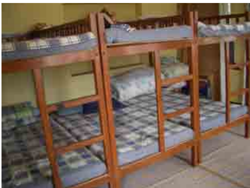
Figure 13: A shelter in Kathmandu run by Nepalese NGO Pourakhi