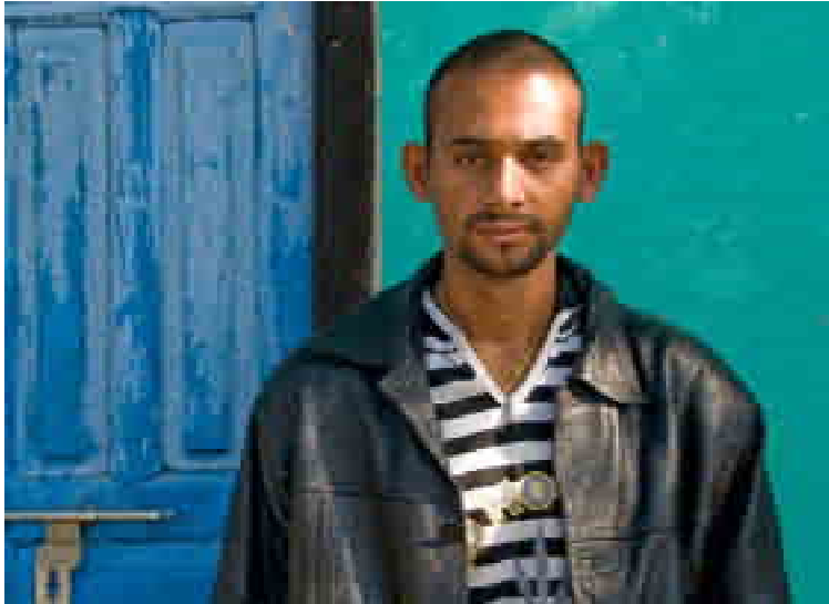
Figure 5: RS was deceived by a village broker in Kailali district

One migrant worker told Amnesty International that he chose to find foreign employment through a broker, instead of a recruitment agency because “the broker was from my village – he was like family”. 64 Another explained that “my broker was from my village so I blindly trusted him. But when I called my broker about my problem, he refused to help me”. 65