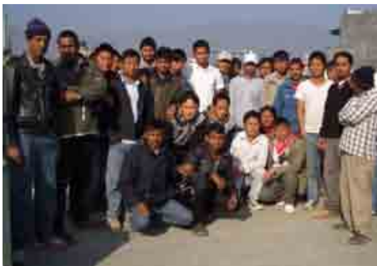
Figure 7: Group representing 46 returnees from Libya

“We paid NPR 125,000 to 130,000 [US$1,730-1,810] in fees to agents in the branch offices in Jhapa, Morang and Sunsari districts. We borrowed this amount from private individuals at 36 to 60 per cent annual interest. None of us have repaid any of the principal amount. Our agents told us that this fee included visa, flight ticket and insurance. We had to pay for the medical exam, airport tax and orientation separately. Only about five per cent of us received a receipt for the total amount without any breakdown of costs. Some of the receipts were on plain paper, while others were on company letterhead. The vast majority of us did not receive any receipt, even though some asked for one. The branch agents merely promised us without delivering it.” 92