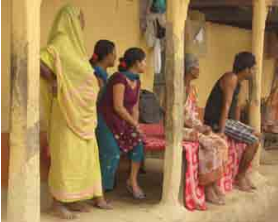
Figure 4: KC and his family in Dhanusa district

A 2010 study, which looked at migration patterns over a six-year period (16 April 2003 to 15 December 2009) identified the Terai region as producing the largest proportion of people who migrated abroad in search of work with Dhanusa, Jhapa, Siraha and Morang as the top four districts. 58