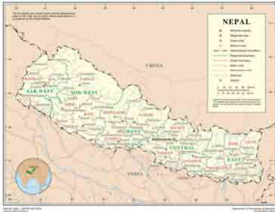
Map of Nepal