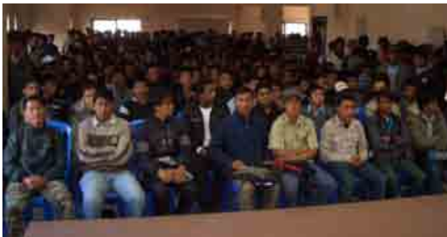
Figure 8: Pre-departure orientation training at Sky Overseas recruitment agency in Kathmandu

This training should facilitate the migration process and ensure that Nepalese migrant workers understand their rights and responsibilities in the country of destination. In cases where the worker is employed in any work requiring skill-oriented training, article 30 of the Act states that such training must also be obtained and from an approved institution. 121