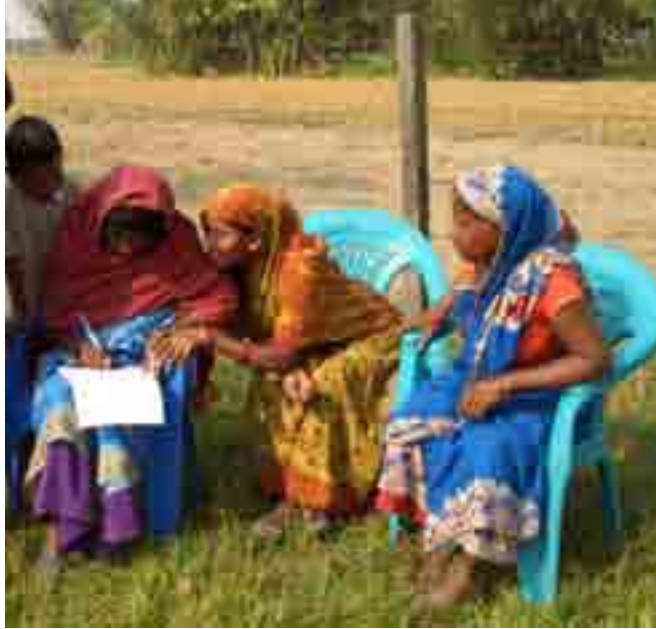
Figure 15: Interviews with families in Morang district

two were provided assistance in getting a flight ticket home but had to leave without resolving their unpaid wages (Kuwait and Saudi Arabia); one had to bribe a police officer for assistance in retrieving his passport and ticket home (Saudi Arabia); and another was turned away by the police (Kuwait).