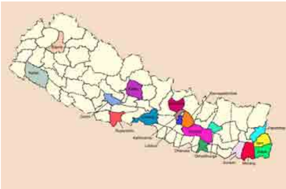
Home districts of migrant workers interviewed