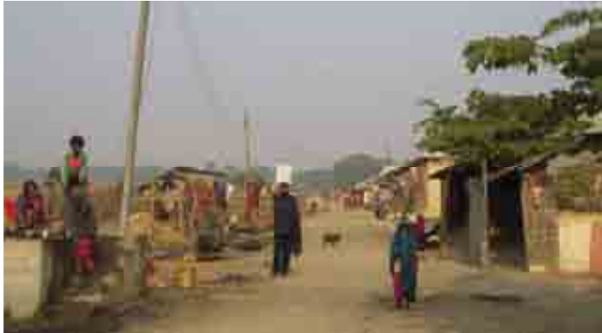
Figure 1: A Dalit community in Sunsari district where interviews took place

Interviews were facilitated by local NGOs and a trade union. 32 The returnees were originally from 17 districts across the Far-Western, Western, Central and Eastern regions of Nepal (see map in Appendix 2), including the Terai region, 33 one of the poorest areas of Nepal where most migrant workers originate. 34 Out of the individual interviewees, 56 were men and 25 women.